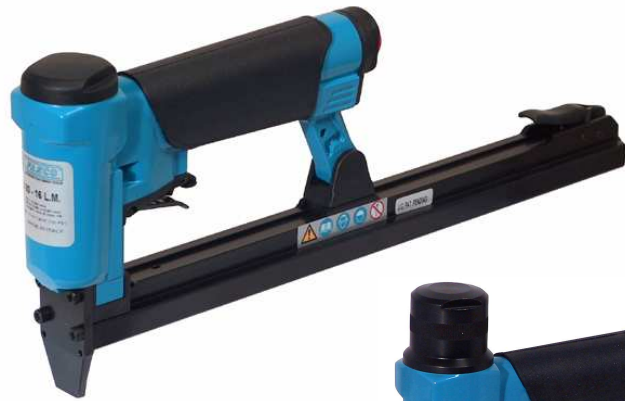
F1B LONG MAGAZINE

Light, powerful, versatile, long lasting tools with sturdy components. These are strengths common to all FASCO fine wire staplers. A perfect balance of the latest technology blended with Old World Craftsmanship. Automatic versions and long magazine models are available for some of the most popular staple series.