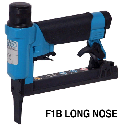
F1B LONG NOSE